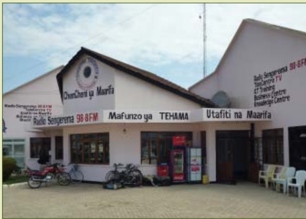
Figure 2.1: Sengerema Tele Center

First established as a tele-centre back in 2001, Radio Sengerema FM is an established institution in Sengerema. An IP must be a Non State Actor (NSA) with the required expertise which not only operates in the District, but also collaborates with the District Council. Radio Sengerema FM has been identified and recommended following the fact that it is heard by residents throughout Sengerema District and even as far as the neighbouring communities of Geita, Biharamulo, Bunda, Shinyanga, Tarime, Mwanza, Kigoma and Kagera.