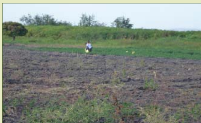
Figure 2.3: Farmers Irrigating using Water Canes at Mbugani Village, Bulyaheke Ward along the Shores of Lake Victoria

Farmers in the District are mainly situated along the shores of Lake Victoria starting from Chamabanda village (Katunguru ward) and Nyalwambo village (Nyamatongo ward) up to Irunda village. The main horticulture products are tomatoes, onions and cabbage which are sold in Mwanza city through Kamanga ferry. There is also Nyampande Green Horticulture farmers group who are heavily engaged in horticultural farming where their main market is also Mwanza city and Sengerema town.