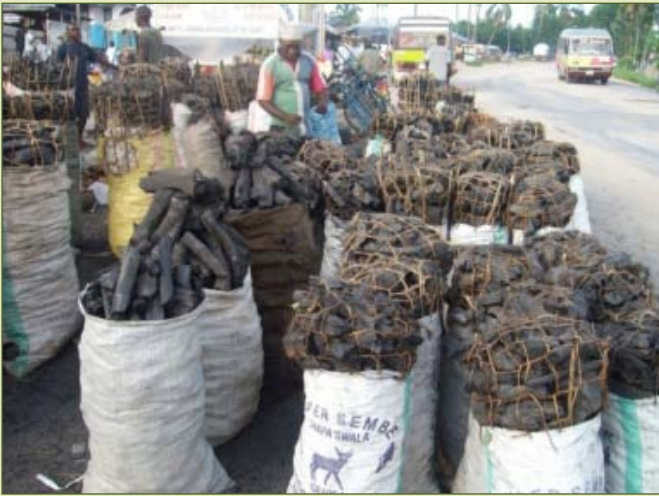
Figure 2.6: Deforestation Motivated by Charcoal Business in Sengerema

However, at Buchosa constituency, the story is very different. In the two divisions of Kahunda and Buchosa, environmental conservation is very high. There is a lot of afforestation i.e. tree planting which has become a cash crop for timber harvesting and forests have grown and have started to encroach into arable land. Banana crop farming has disappeared. There is also a Mbawa Kavu project that aims at addressing the problem of Water weeds (Magugu Maji) along the shores of Lake Victoria and rivers in the District.