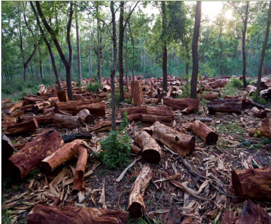
Figure 1.1: Deforestation Motivated by Biomass Trade in Sengerema