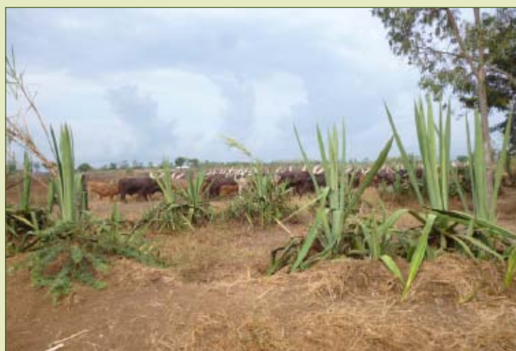
Figure 2.4: Cattle – Ankole in Sengerema

At the market place, an Ankole weighing between 200-300kg can be sold between TZS 600,000 to TZS 1,000,000. On the other hand, Zebu tends to be sold for much less and weigh between 150-200kg. Livestock keeping and the limited areas for grazing and water has led to conflicts between pastoralists and agriculturalists in the District.