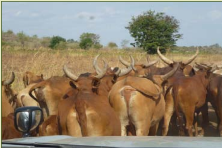
Figure 2.5: Cattle – Zebu

For example, there exists a conflict at Chamabanda village where pastoralists from Nanchenche ward with huge cattle stock have invaded farmers' land, causing environmental degradation and ruining agricultural crops. Nanchenche ward is an extremely arid area near Geita region and tends to force herders to look for pasture and water elsewhere.