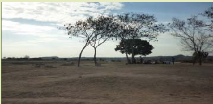
Figure 2.2: Bare Landscape in Mbugani Village, Bulyaheke Ward along the Shores of Lake Victoria

Much of the surface surrounding village communities in the District is bare (Fig. 2.2). All the trees (forests) have been depleted. Due to this environmental stress from deforestation, unsustainable farming, unsustainable harvesting of forest products etc., a number of beekeeping groups have been identified in the effort to support them to protect forests and plant trees.